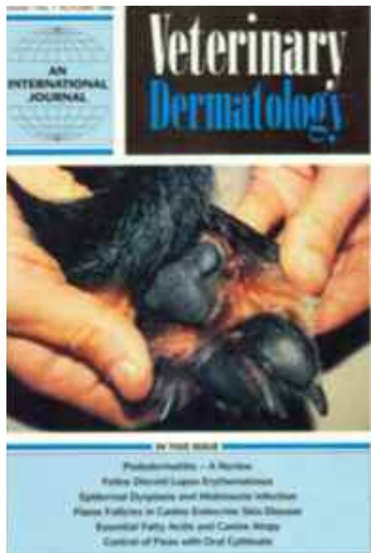
First issue of Veterinary Dermatology

The journal is now produced by Wiley-Blackwell, based in Oxford. For 2010 the journal was ranked 23/145 journals in veterinary science with an impact factor of 1.647. Veterinary Dermatology is now well established as a prestigious world veterinary journal that is eagerly awaited every two months by its readers including the members of the seven societies that have it as their official journal.