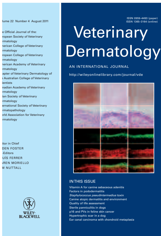
August 2011 issue of Veterinary Dermatology